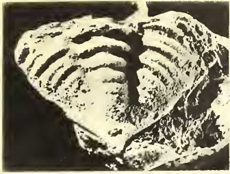
1 x 4.5